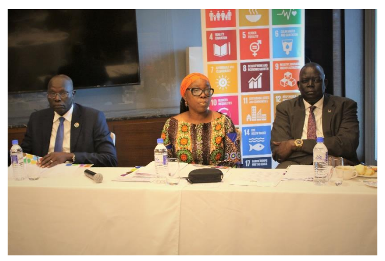
Dier Tong Ngor, the Minister of Finance and Planning(L), Sara Beysolow Nyanti, Resident Coordinator(C) Deng Dau Deng the Deputy Minister of Foreign Affairs and International Cooperation(R) during the dialogue at Radisson Blu hotel in Juba.

The United Nations Resident Coordinator in South Sudan and Representatives of the UN Agencies in South Sudan convened a dialogue with the Ministers of Finance and Planning, Foreign Affairs and International Cooperation on the draft of the 2023-25 United Nations Sustainable Development Cooperation Framework (UNSDCF), due to be signed by the UN and the Government of the Republic of South Sudan in September 2022.