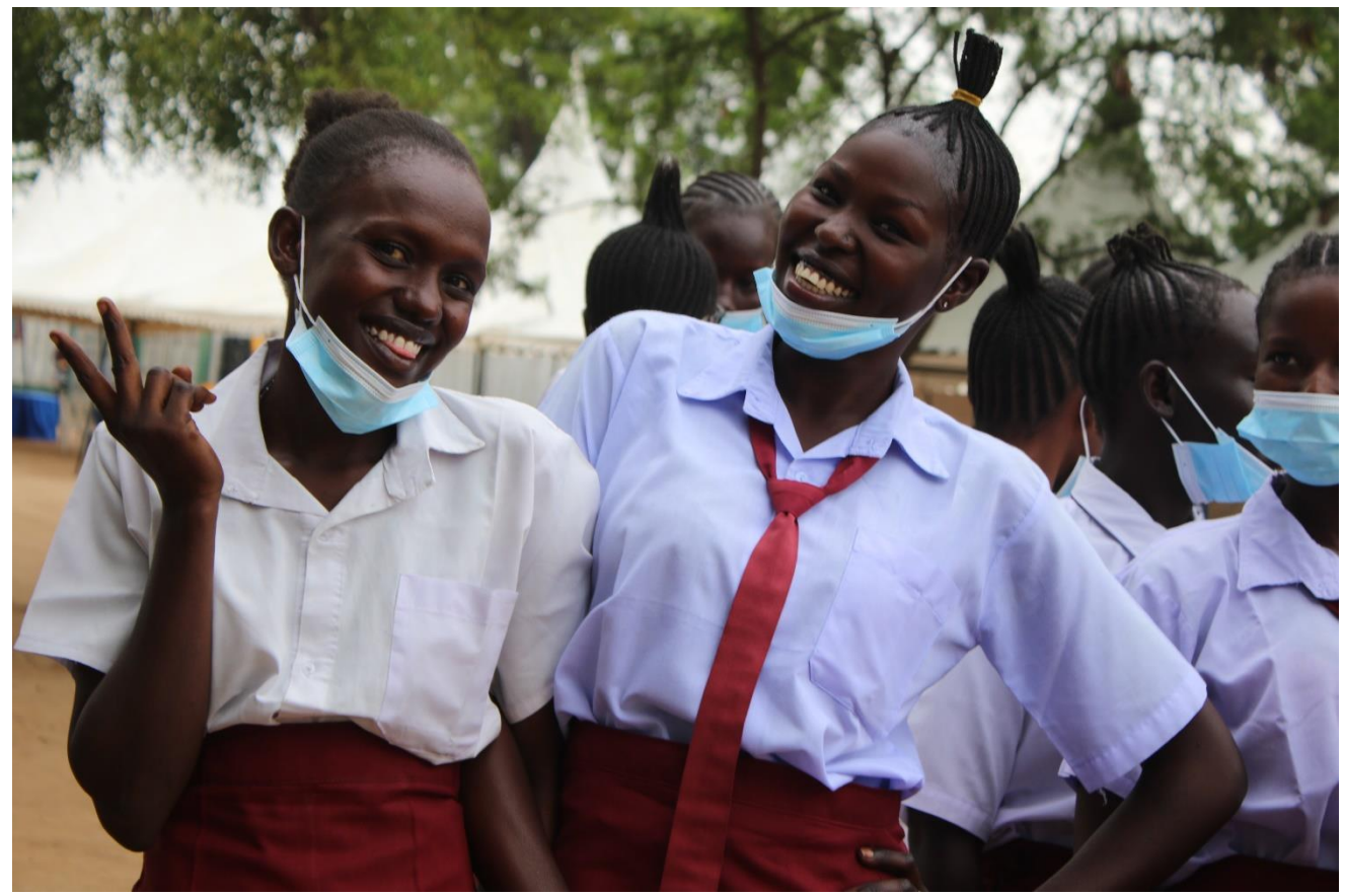
Secondary School students join the celebrations at Nyakuron Cultural Center

The Minister of youth and Sports Dr. Albino Bol Dhieu advised the youth to work together with the elderly to enable continuity and exchange of innovative ideas.