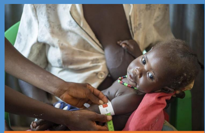
Mothers are taught how to use a MUAC tape.

If the reading is at yellow the child is suffering from moderate acute malnutrition and if the reading is at red, then the child is suffering from severe acute malnutrition. "We always tell mothers to take their children to the primary health care center here in Bazungua – where they can get treatment for them," she says. Severe acute malnutrition is a very serious condition among children under five. If untreated, it can lead to more health complications.