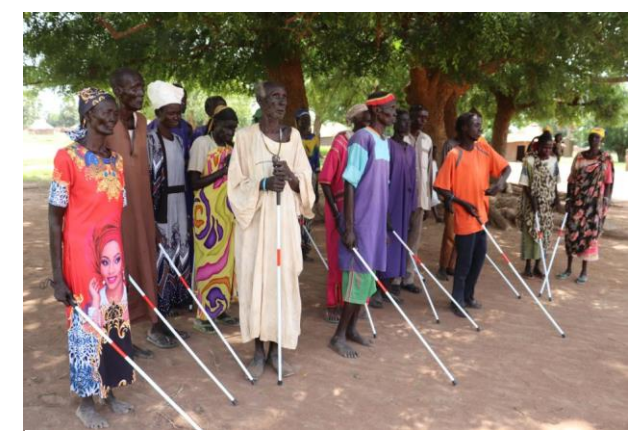
Persons with disability during orientation & mobility training in Tonj South.

The International Organization for Migration (IOM) has empowered more than 200 persons with disabilities after completing a six-week training in English Braille, Sign Language, and Orientation and Mobility.