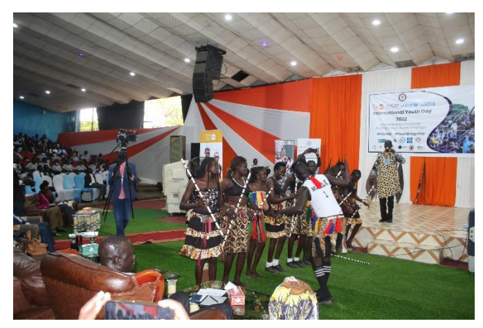
Maale dance group from greater upper Nile performing at the youth day celebration.

The event was attended by youth from different walks of life, representatives of UN agencies, funds and programs, government representatives and representatives of the International Community in South Sudan.