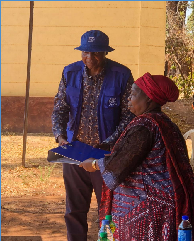
IOM hands over files of the MHPSS center to the Ministry of Gender Child and Social Welfare.

The International Organization for Migration (IOM) has handed over a Mental Health and Psychosocial Support (MHPSS) centre to the State Ministry of Gender Child and Social Welfare in Wau.