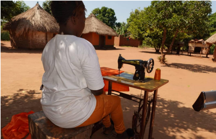
Former child soldier Susan* in Yambio sewing clothes to earn a living.

While South Sudan's civil war ended in 2018, conflict and violence affecting and involving children remains common. Former child soldiers still suffer from the traumas of war, a training programme allows them to recoup some of their lost childhood dreams.