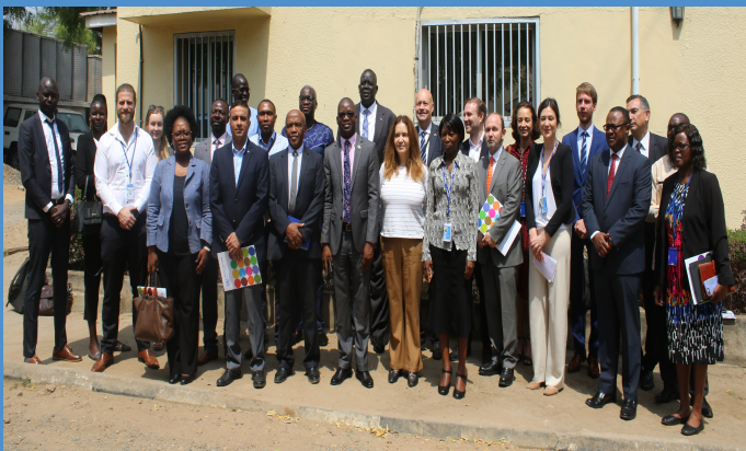
Members of the Peacebuilding Fund Joint Steering Committee.

The JSC is co-chaired by the Resident Coordinator and the Minister of Peacebuilding. Other members include heads of UN agencies, national and international NGOs, interested donors and International Finance Institutions.