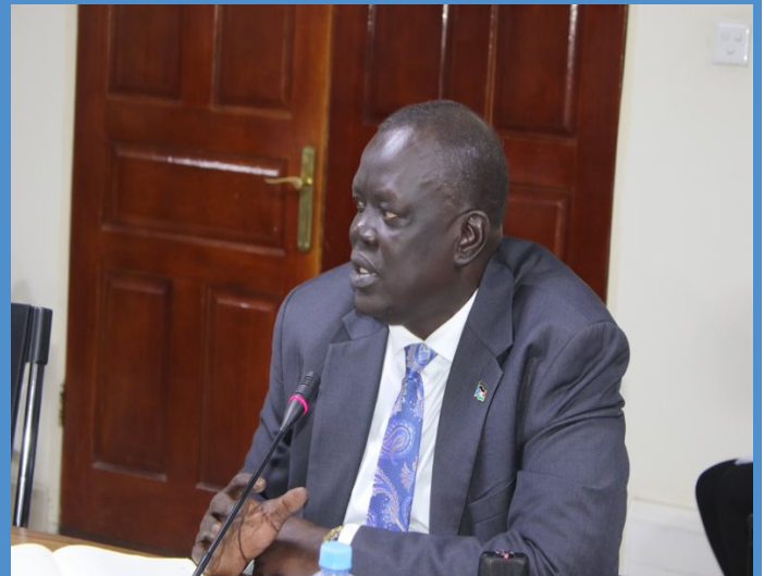
Hon. Deng Dau Deng, Deputy Minister of Foreign Affairs and International Cooperation.

Speaking during the launch, Hon. Deng Dau Deng, the Deputy Minister of Foreign Affairs and International Cooperation said " it is important for us as the Government of South Sudan and UN agencies to collectively coordinate and plan together so that our priorities meet the aspirations of the people of South Sudan."