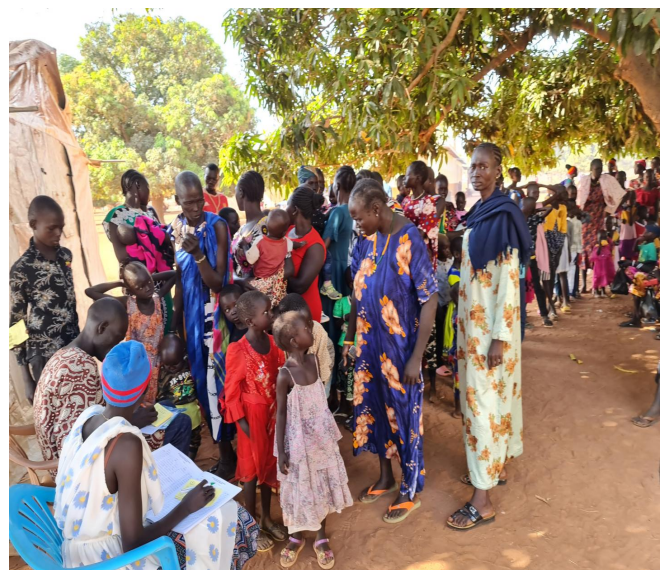
Women holding their babies wait for a measles vaccine.

To get vaccines into the arms of children who remain unprotected, WHO with funding from the United States Agency for International Development (USAID), continue to work closely with the Ministry of Health and partners to conduct reactive measles vaccination campaigns in 15 of the 22 affected counties targeting individuals surrounding cases to break transmission, heighten rapid detection and response to cases, increase immunization coverage including distribution of essential medicines to manage measles complications, said Dr Bategereza.