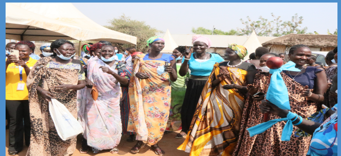
Women after receiving dignity kits in Juba.

To support women and girls' dignity, self-esteem, and confidence, UN Women with the support of the Embassy of Japan in South Sudan distributed 70 dignity kits to internally displaced people (IDPs) at an IDP Camp in South Sudan.