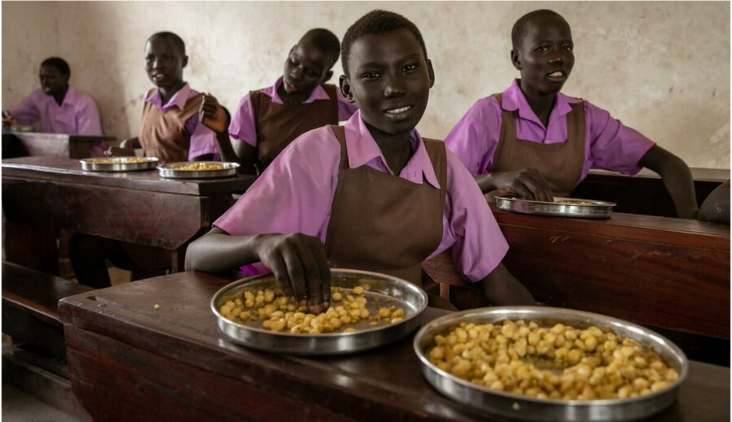
With the cost of a plate of food up 70 percent since the start of the Ukraine war, school meals are a lifeline for children in Torit.

The day starts early at the Grace community school in Torit, Eastern Equatoria. At 6:30 am, well before students arrive, a fire is lit to prep for lunch. Even though it's still early, the grains and pulses will cook slowly through the morning with cooks stirring the huge pots containing enough for the 403 lunches that will be served.