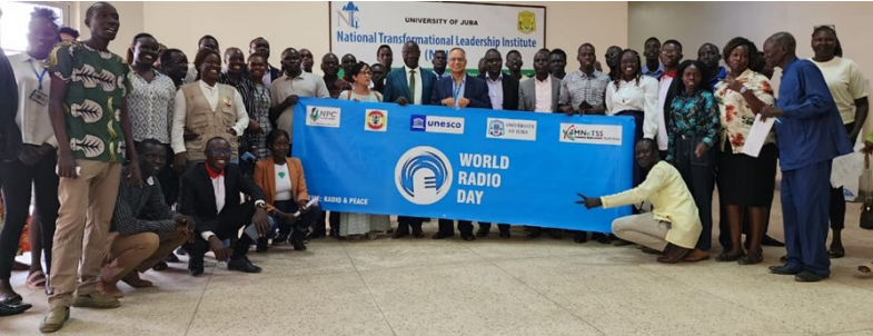
Participants pose for a group photo during the World Radio Day celebration in Juba.

On 13 th February 2023, South Sudan joined the rest of the world to commemorate World Radio Day under the theme: Radio and Peace.