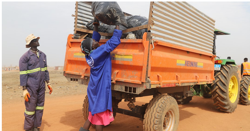
IOM transports an average of 300 metric tons of solid waste per week to the landfill for disposal.

When solid waste collection in Bentiu Internally Displaced Persons (IDP) camp came to a halt in February 2021 due to funding constraints, waste started piling up across the camp, with garbage littering everywhere.