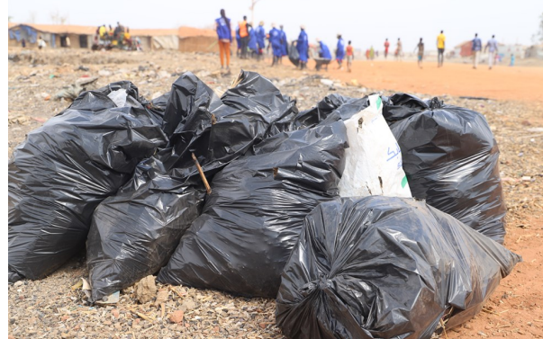
Bags of garbage collected awaiting disposal to the landfill in Bentiu.

Read the full story online: https://bit.ly/40QfRoB