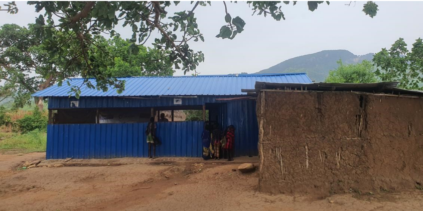
A nutrition center supposed by UNICEF.

UNICEF and partner ForAfriKa work to tackle high rates of common illnesses and malnutrition in children and mothers in Boma