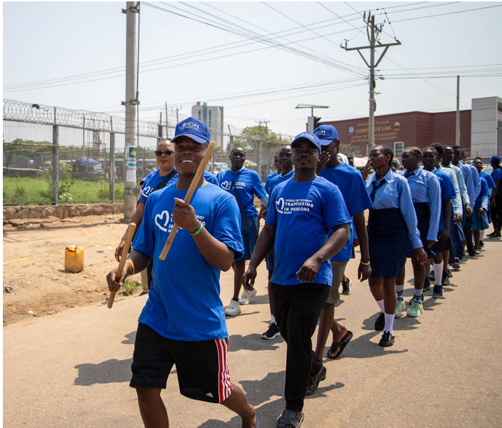
Migrant communities march to raise awareness of trafficking in persons.

The International Organization for Migration together with the Human Anti-Trafficking Network brought together students, migrant communities from countries neighboring South Sudan, representatives from South Sudan organized forces to commemorate the World Day Against Trafficking in Persons.