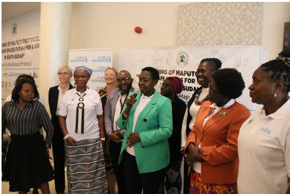
Speaker of Parliament, minister of gender UN Women Deputy Representative, Ambassadors pose for a photo during the launch.

of South Sudan to uphold relevant laws that impact on the lives of the people of South Sudan.”