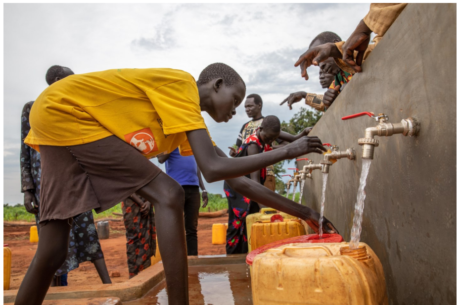
A multi-purpose borehole sunk by FAO to benefit the Rambai villagers.

In addition to having access to clean water, Ayor says