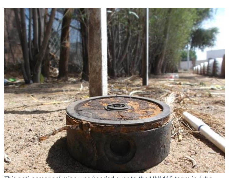
This anti-personnel mine was handed over to the UNMAS team in Juba, Central Equatoria by a South Sudan People's Defense Force soldier in May

The document will be annexed to the National Technical Standards and Guidelines (NTSGs) for humanitarian mine action operations in South Sudan, a living document that serves as a reference for mine action implementation within the local context and defines quality assurance standards and accreditation criteria in the country.