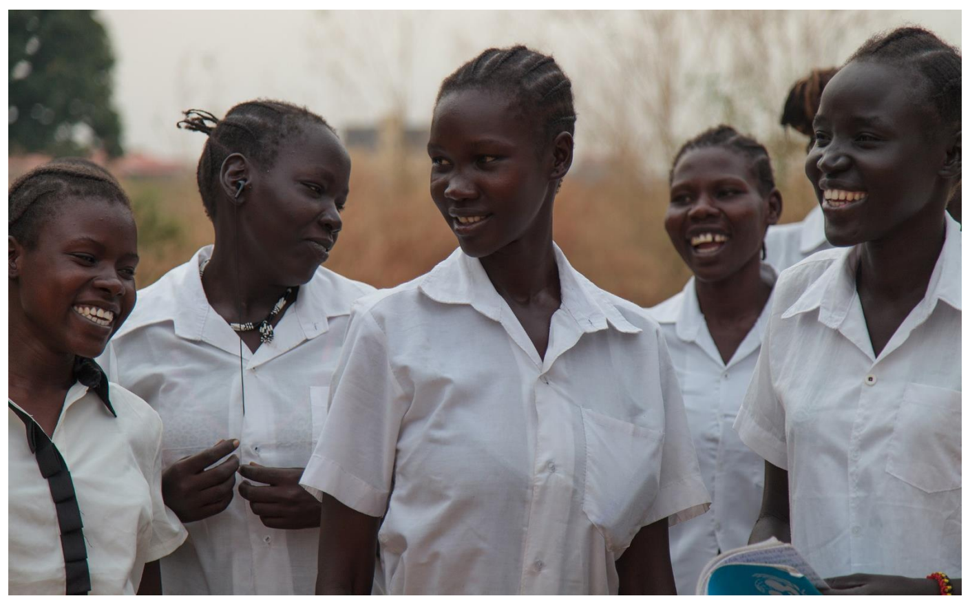
In South Sudan, the most prevalent of the harmful practices is child marriage, with 45 per cent of girls married off before the age of 18. Keeping adolescent girls in school is one way to keep them out of child marriage.

Mr. Alain Noudehou, Deputy Special Representative of the UN Secretary-General to South Sudan, said the Sustainable Development Goals cannot be achieved without empowering women and girls. "We can make this happen by taking down barriers including harmful cultural and traditional practices. The achievement of gender equality, women's rights and women's empowerment can make a significant contribution to poverty-reduction, inclusive growth, democratic governance, and peace and justice," he said.