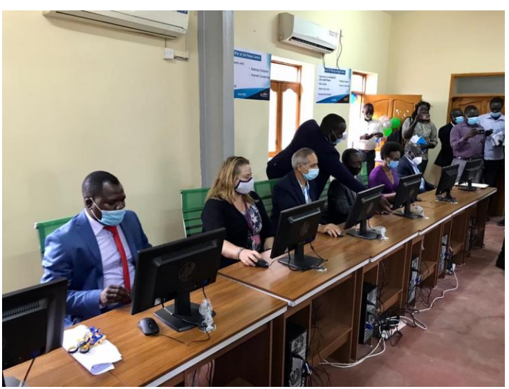
Peace Center for Journalists launched at AMDISS.

UNESCO and UNDP through the UN Peace Building Fund Programme in partnership with the Association for Media Development in South Sudan launched and handed over a fully established Peace Centre for journalists with the aim to promote Peace Education, Research and Access to Information.