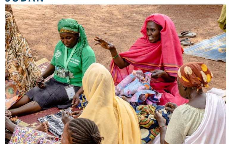
Members of the Women's Support Group at the Cathedral Collective Centre in Wau, South Sudan.

A group of women sit under a large mango tree inside the Cathedral Collective Centre in Wau. They sit barefoot with their legs stretched out under the tree that boasts succulent yellow mangoes hanging low from the branches. Scattered around is a kaleidoscope of beautiful kitenge cloth, a popular African wax fabric made up of colorful prints.