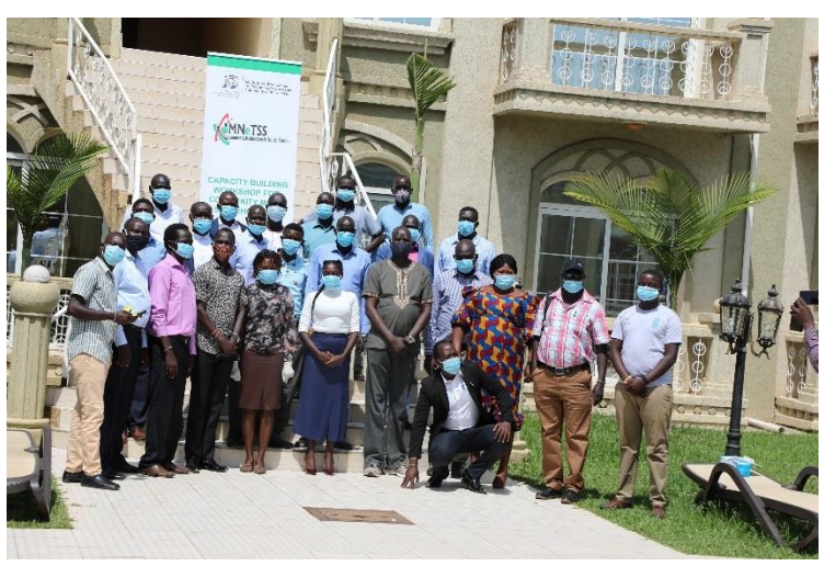
Community media stakeholders pose for a picture after a meeting.

A group of women sit under a large mango tree inside the Cathedral Collective Centre in Wau. They sit barefoot with their legs stretched out under the tree that boasts succulent yellow mangoes hanging low from the branches. Scattered around is a kaleidoscope of beautiful kitenge cloth, a popular African wax fabric made up of colorful prints.