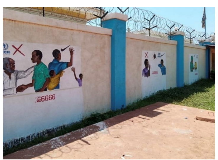
The UNHCR external office walls have been painted with COVID-19 key messages targeting people with hearing impairment.