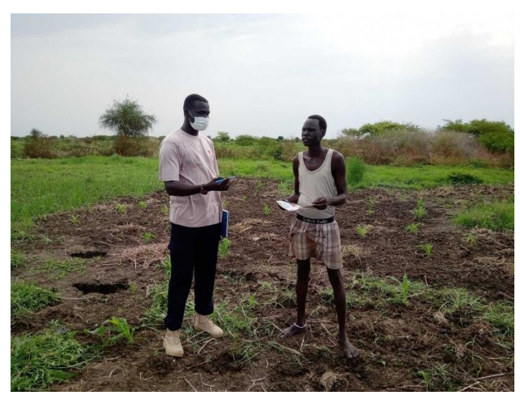
An UNMAS Community Liaison Officer provided explosive ordnance risk education to a farmer cultivating proximate to the site.