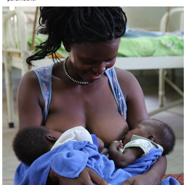
Two is better than one for this mommy breastfeeding her twins in a hospital located in Juba. Breast milk carries antibodies from the mother that help combat diseases such as pneumonia and diarrhoea, and it also lowers the risk of chronic conditions, such as obesity, high cholesterol, high blood pressure and diabetes later in life.

In 2020, 1.3 million children under five will suffer from acute malnutrition. Increasing awareness of how this can be prevented is paramount.