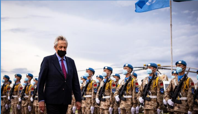
The New SRSG on arrival at Juba International Airport.

“Our priority is to support all efforts to push the peace process forward with a focus on key areas such as constitution-making, security, justice and economic reforms, and assisting preparations for elections. I am very much looking forward to serving and supporting the people of this country so that they can enjoy the much brighter future that they deserve.”