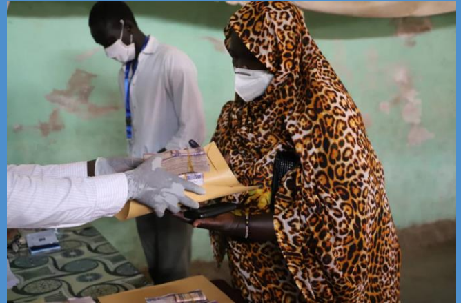
A resident of Juba receiving her cash support.