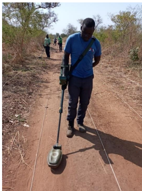
An UNMAS deminer used a detector with ground penetrating radar to search for anti-tank mines in Malakal, Upper Nile.

To report a suspicious object, please contact UNMAS at its 24-hour hotline: 0920001055 or via email at unmas.ss.ops@unops.org