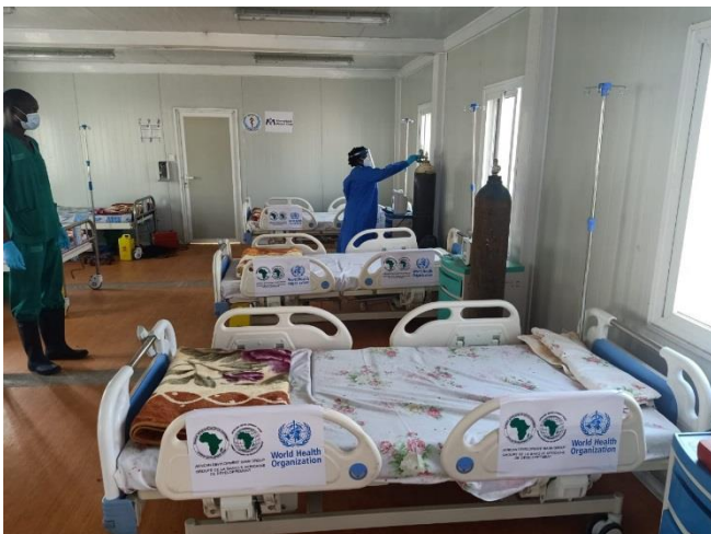
The Juba COVID-19 ICU unit.

The African Development Bank and WHO have delivered essential medical supplies, including 12 ICU beds, over 5 000 infection prevention and control items, 20 oxygen concentrators, 71 blood pressure monitoring machines and over 250 boxes of various essential medicines to the