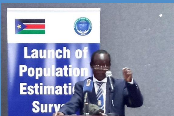
Vice President James Wani Igga at the launch of the 2021 Population Estimation Survey.