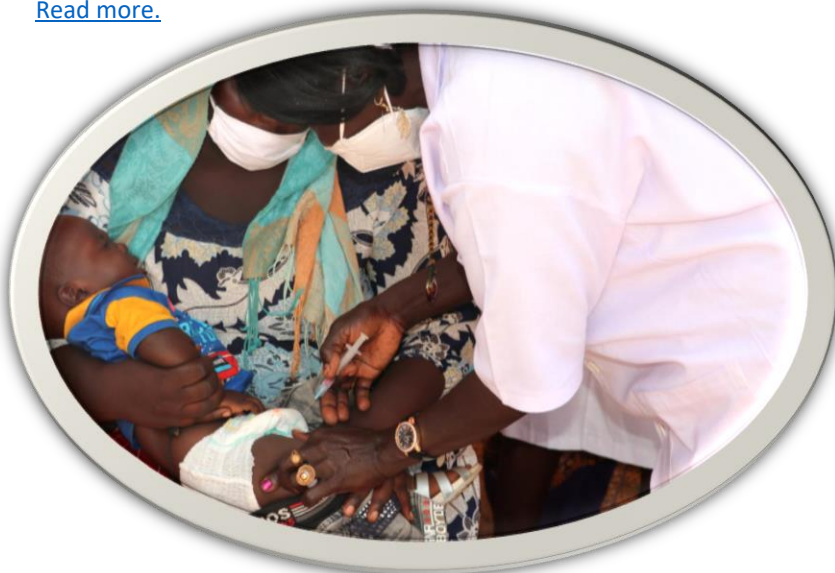
A health worker gives an injectable inactivated polio vaccine in Juba.

United Nations Resident Coordinator's Office UNDP Compound, Ministries Road Plot 21, P.O.BOX 410 Juba, South Sudan