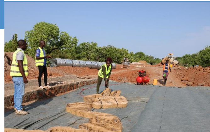
The use of geo-cells in feeder road construction ensures that materials are compact and intact to avoid disintegration during rainy season.