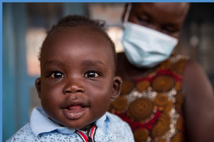
Breast Feeding helps prevent malnutrition among children.

More about the breastfeeding campaign on www.unicef.org/southsudan