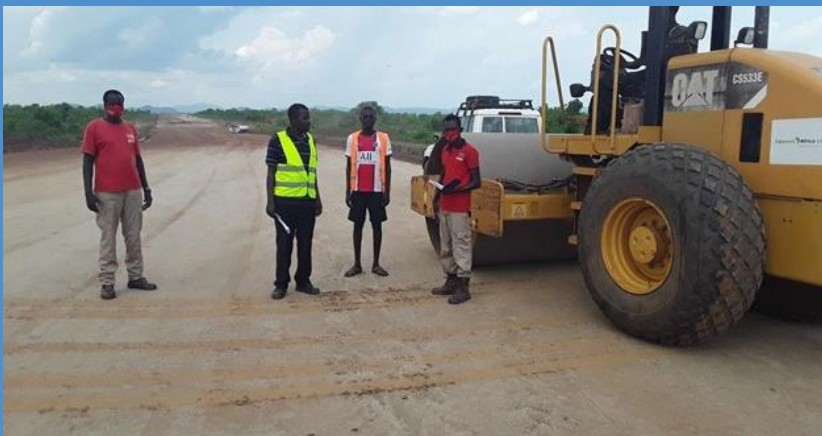
An UNMAS team delivering explosive ordnance risk education to a road construction crew on the Nesitu-Torit Road in Central Equatoria.

In April 2021, the construction company was able resume their work