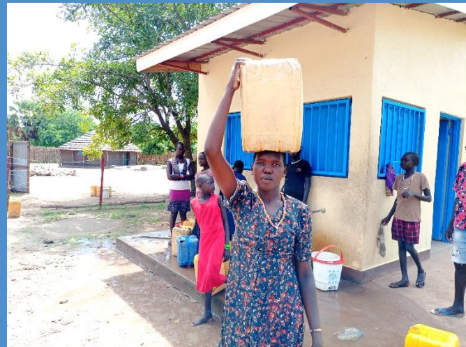
Akur is happy to be able to access clean water.

UNOPS helps to drive Sustainable Development, enhance connectivity, provide critical and lifesaving services, and supplies and improve peace and