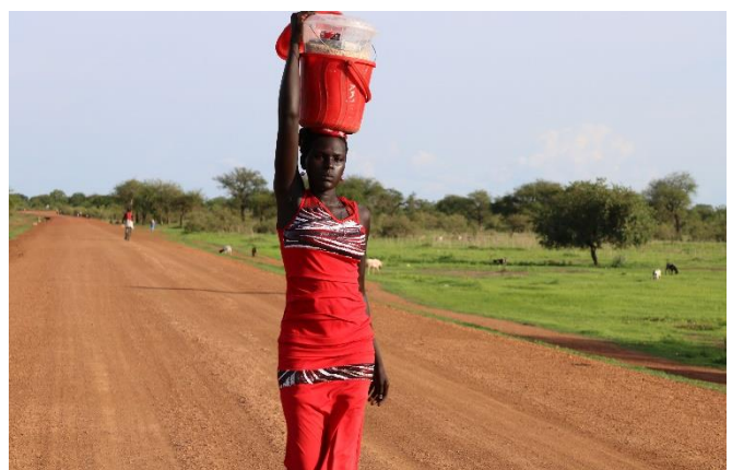
A woman heading to the market using the road construction by UNOPS.

United Nations Resident Coordinator's Office UNDP Compound, Ministries Road Plot 21, P.O.BOX 410 Juba, South Sudan